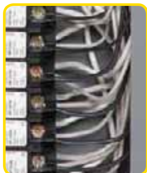
▲ Pigtail Neutral connection